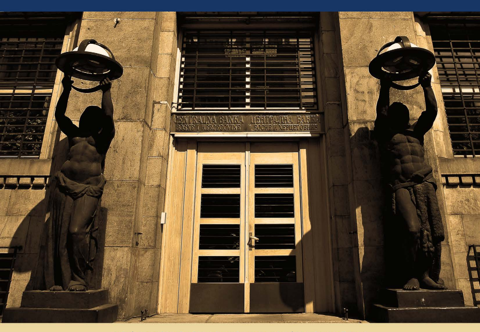
Info | Central Bank of Bosnia and Herzegovina | March - April 2016