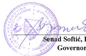
Senad Softić, Ph.D. Governor

Sarajevo, 25-10-2022 No: 123-13-4-410-10/22